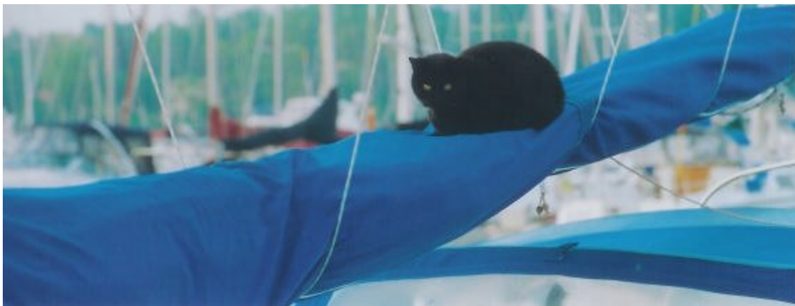
Spider enjoying her favorite perch aboard her new Nonsuch 30 Cat Boat—aptly named Purrfection