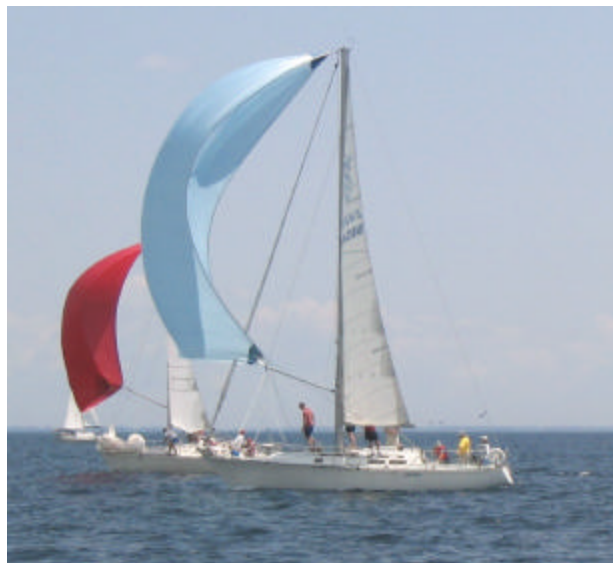
2004 EYC at Collins Bay

* These races are part of the Kingston Keelboat Championship Series.